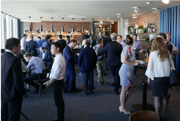
NETWORK AND SHARE YOUR EXPERIENCES