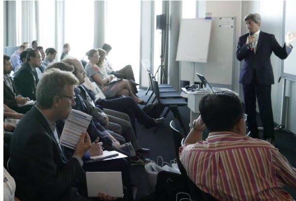
STAY UP-TO-DATE ON INDUSTRY TRENDS