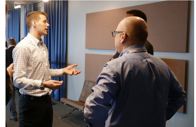
MEET OPAL-RT'S EXPERTS