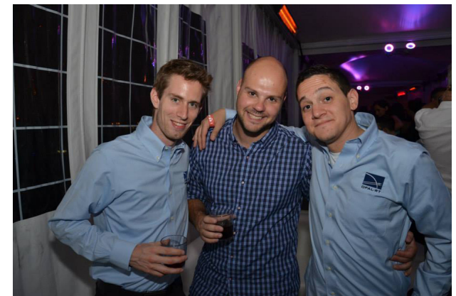
DISCOVER POTENTIAL PARTNERS