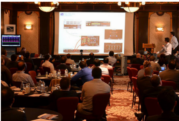
ATTEND TECHNICAL PRESENTATIONS